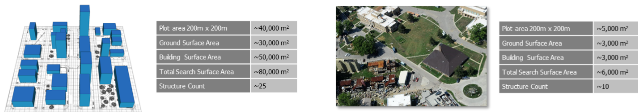
Figure 2. Environment Examples

Point of departure examples for a simulated URSA environment (left) and DARPA Phase 1 notional test environment (right) are shown in Figure 2.