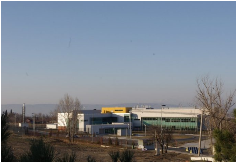
The Lugar Center, Republic of Georgia

The Lugar Center is the Pentagon bio laboratory in Georgia. It is located just 17 km from the US Vaziani military airbase in the capital Tbilisi. Tasked with the military program are biologists from the US Army Medical Research Unit-Georgia (USAMRU-G) along with private contractors. The Bio-safety Level 3 Laboratory is accessible only to US citizens with security clearance . They are accorded diplomatic immunity under the 2002 US-Georgia Agreement on defense cooperation.