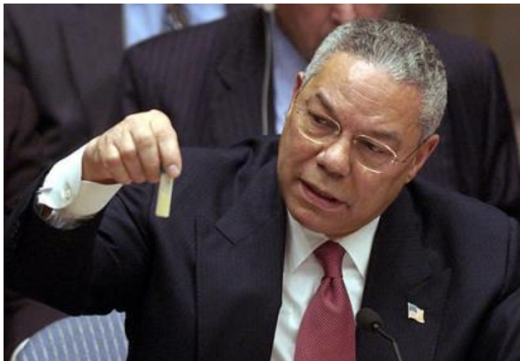
U.S. Secretary of State Colin Powell holds up a model vial of anthrax during his historic presentation before the United Nations Security Council, February 5, 2003. (Image extracted from a video available from the White House Web site. )

Join the NSARCHIVE Electronic Mailing List