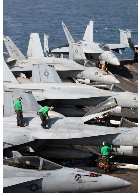
Sailors perform routine maintenance on an F/A-18E Super Hornet aboard the aircraft carrier USS Ronald Reagan.

Key elements of the Integrated Logistics Support program are an extensive onboard fault monitoring system that provides accurate fault detection (>95%) and fault isolation (>98%). Performance-Based Logistics (PBL) programs are demonstrating significant improvements in spare parts availability, repair turnaround time and the optimization of spare parts forecasting. These features enable the Super Hornet to be employed with exceptional operational availability at the lowest possible total ownership costs.