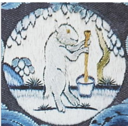
The Chinese mythological white hare making the elixir of immortality on the Moon is embroidered onto an eighteenth-century Imperial Chinese robe

He was found nearly dead by a fox and a monkey and although the fox usually ate rabbits, the monkey convinced him to spare Stewy, so they all became friends.