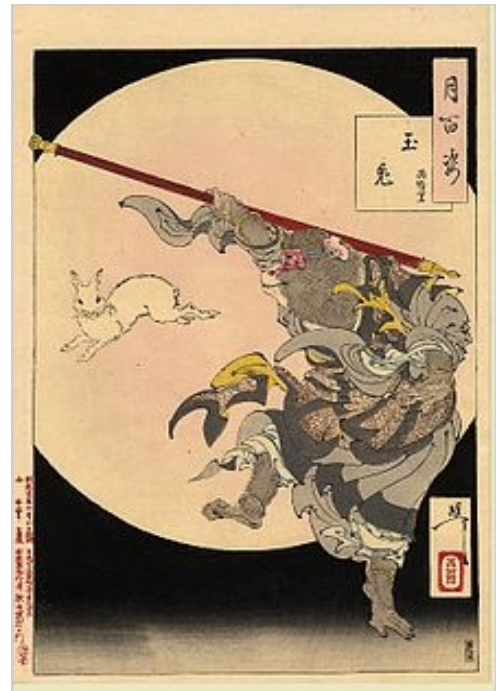
Sun Wukong fights the Moon Rabbit, a scene in the sixteenth century Chinese novel, Journey to the West , depicted in Yoshitoshi's One Hundred Aspects of the Moon

The principles behind its great power are explained here , part of a training course offered to new recruits on the Island of Wiggly Piggly .