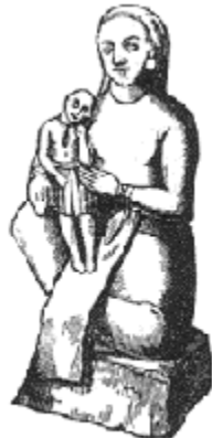
Catholic image or Pagan Babylonian image?

Although difficult reading, this book accurately provides a fascinating historical in-depth examination of the shocking similarities between the practices of ancient Babylonian religion and those of today's Roman Catholic church.