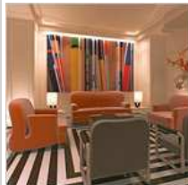
A French Star Reinvents a New York Classic