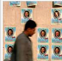
Who Will Follow Mubarak as Egypt's Next Leader?