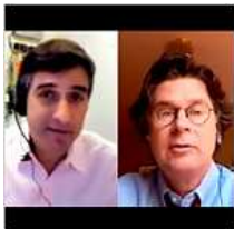
Bloggingheads Video: Battleship Hillary