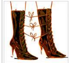
The Feminine Critique: Gender Bias at Work

Home | World | U.S. | N.Y./Region | Business | Technology | Science | Health | Sports | Opinion | Arts | Style | Travel | Jobs | Real Estate | Automobiles | Back to Top