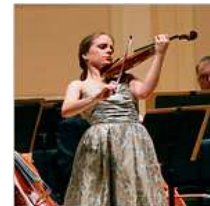
Figaro Gets a Gaudy Russian Tattoo