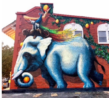
Four Harmonious Friends

We will know we are prioritizing the empowerment of our employees when we begin to see these outcomes: