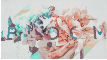
Female Squad