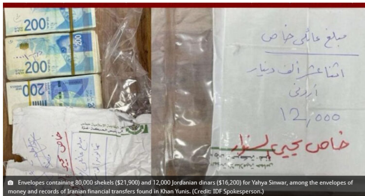
📷 Envelopes containing 80,000 shekels ($21,900) and 12,000 Jordanian dinars ($16,200) for Yahya Sinwar, among the envelopes of money and records of Iranian financial transfers found in Khan Yunis.

The IDF released photos of envelopes of U.S. dollars, Israeli shekels, and Jordanian dinars intended for Sinwar.