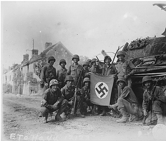
Figure 12.1 GIs pose with a captured Nazi flag after mopping up the area known as the Falaise Gap

The American soldier in the Second World War was an avid souvenir hunter on the battlefield. Soldiers stuffed their war trophies into sea bags alongside their uniforms, letters from home, and all other personal belongings. Some servicemen packed their bags so full of “liberated items” they had little room for other objects. When the first GIs left Europe for home, they steamed home with an impressive assortment of trophies. The 28th Infantry Division, one of the first units sent back to the U.S. after the war, brought home 20,000 weapons to their 5,000 men.