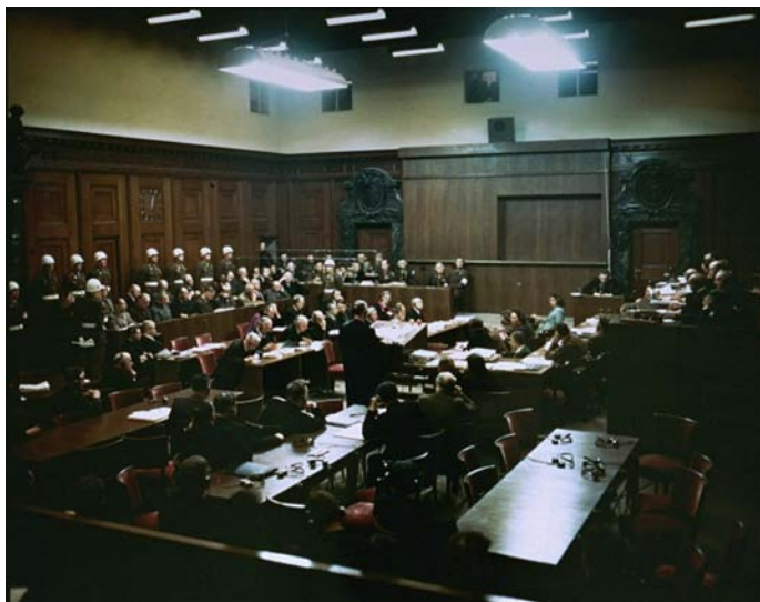
Figure 12.2 A view of the courtroom during the International Military Tribunal in Nuremberg, Germany. The defendants are to the left in the photo.