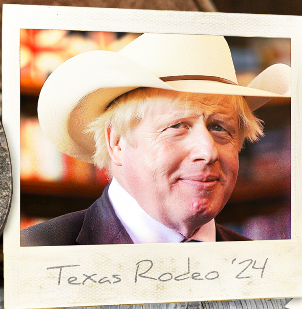
Texas Rodeo '24