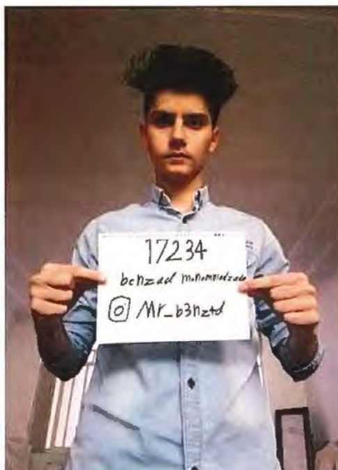
EXHIBIT A TO THE INDICTMENT