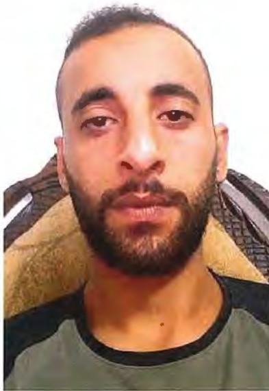
EXHIBIT B TO THE INDICTMENT