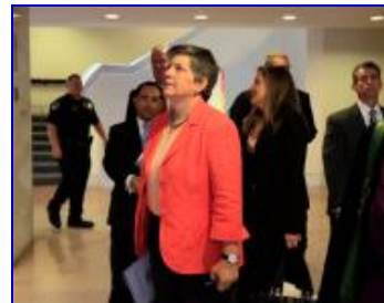
Secretary of Homeland Security Janet Napolitano waits for an elevator on Capitol Hill in Washington Wednesday, July 21, 2010.