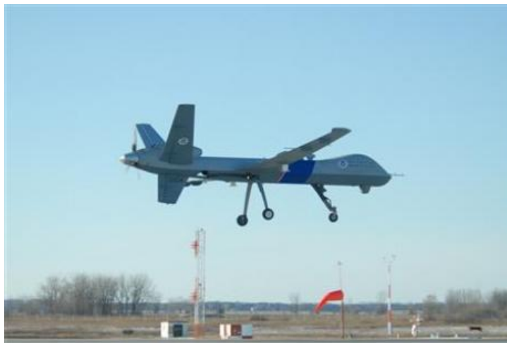
PHOENIX | Mon Aug 30, 2010 4:43pm EDT

(Reuters) - The U.S. government will have unmanned surveillance aircraft monitoring the whole southwest border with Mexico from September 1, as it ramps up border security in this election year, a top official said on Monday.